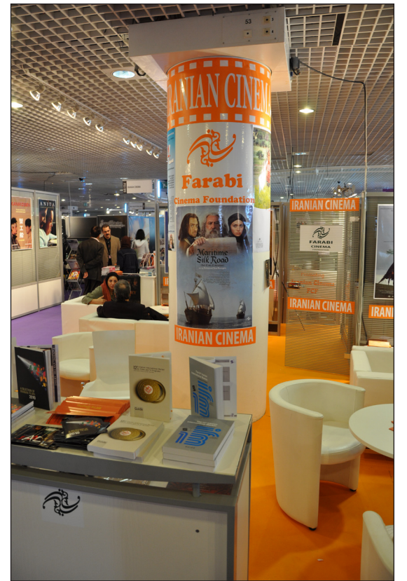
Farabi Cinema Foundation's Stand at the Marche Du Film